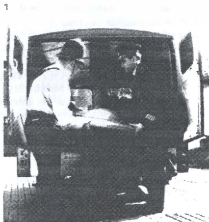
Police officers in Kent take away a 'UFO' for inspection

Locations were the Isle of Sheppey and Bromley, Kent, Welford and Winkfield, Berkshire, Chippenham, Wilts and Clevedon, Somerset. Nothing special about the actual placements which were fields, back gardens or golf courses. The first object was found at 8.00 am; the last not until mid-day. By 9.00 am the MOD had details on their desks and a senior unnamed flight lieutenant was placed in charge of the investigation. All concerned took this most seriously with the over-riding fear that the Soviets had planted a surprise attack on the UK. Utmost secrecy was imposed, but already the press had got wind of the situation, and a mass of reporters thronged around Bromley police station at the same time as one of the saucers was being off loaded there.